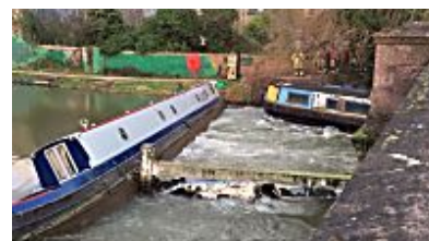
Crashed narrow boat in Oxford to be removed by crane