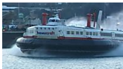
Hoverspeed hovercraft set to be destroyed