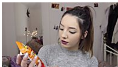
Reaction video: British girl tries American sweets